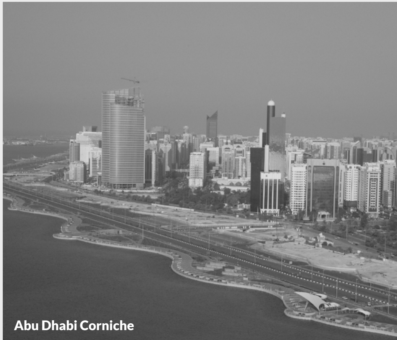
Abu Dhabi Corniche

Our founder, family, and teams are renowned for their extensive background that spans 4 decades, as our team took part in the most prestigious and challenging projects in the United Arab Emirates.