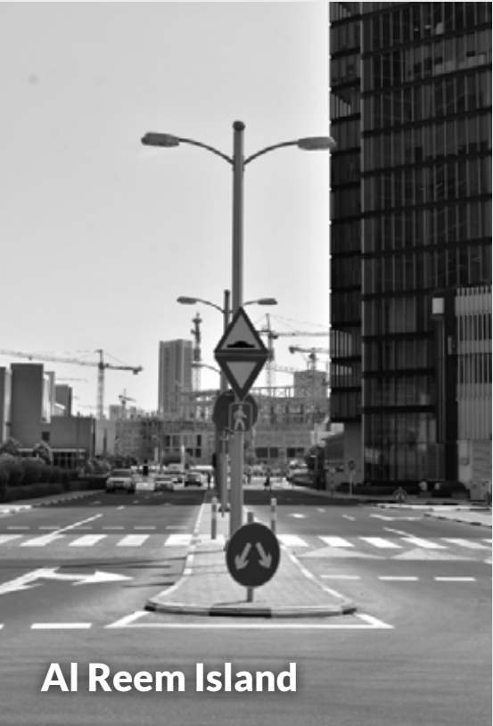
Al Reem Island