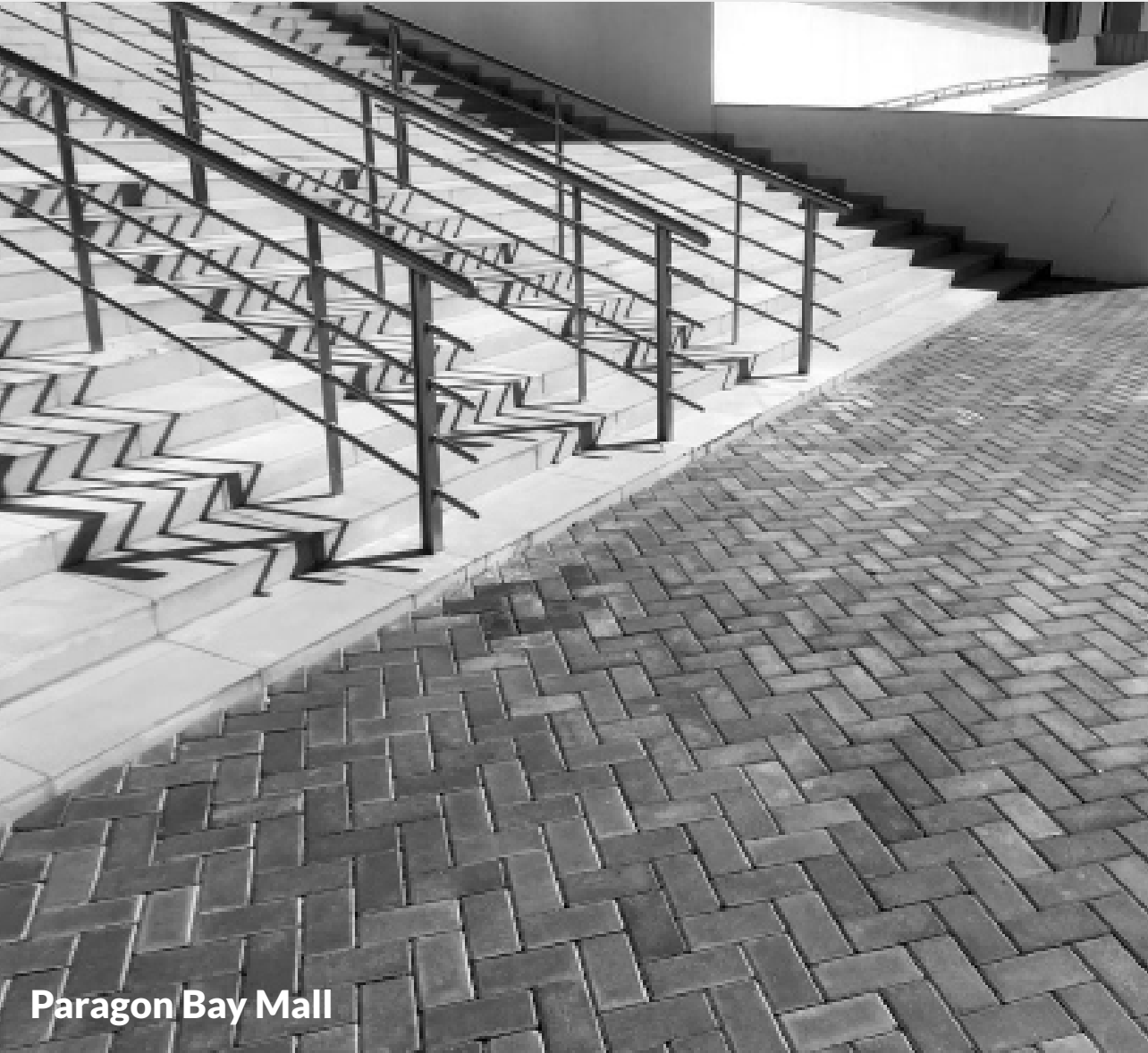
Paragon Bay Mall

Yebna GCC covers major and minor building and infrastructure projects in the Emirate of Abu Dhabi.