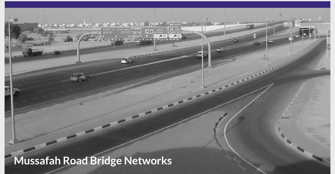
Mussafah Road Bridge Networks