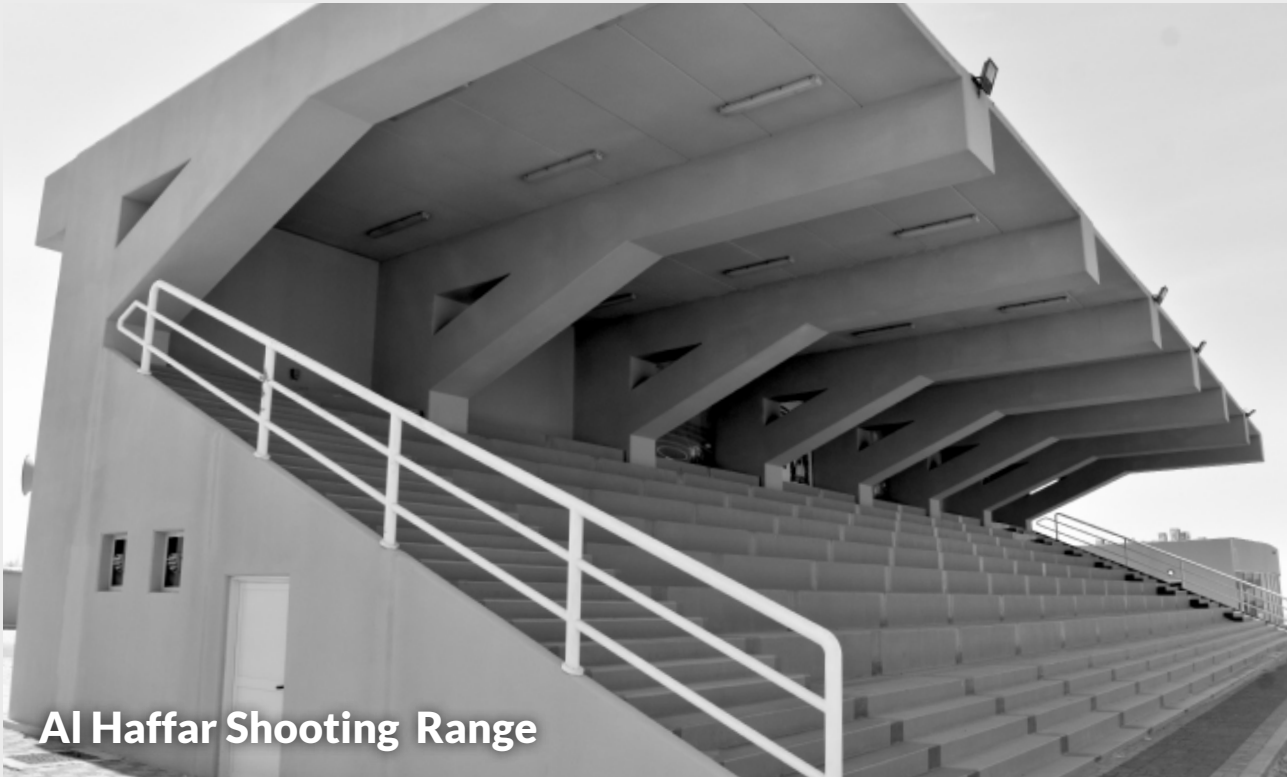
Al Haffar Shooting Range