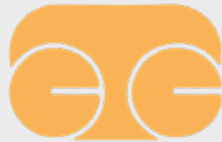
General Transportation Company